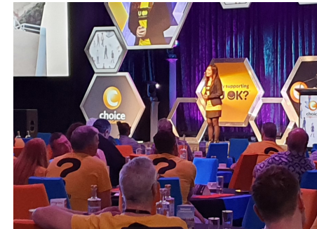
Speaking at the Choice National Conference on R U OK? Day.

100 LUNCHES WITH STRANGERS STRANGERS NO MORE